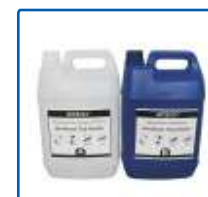
MTB-3329 Epoxy Top Coat