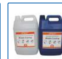
MTB-3328 Epoxy Middle Coat