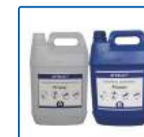
MTB-3327 Epoxy Primer